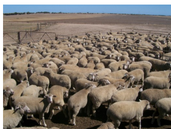
2013 Prime lambs

To meet the total needs of today's sheep producers, 50 June/July 2012 drop White