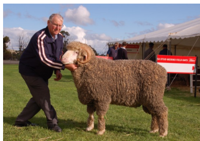
Growing rich, nourished pearly white, deeply crimped wool.

Watch out for more sons of Exceller, half-brothers to Exceller108. (pictured, who cut 20.5kg of 18.3μ wool for 13 months wool growth as 2y.o. and weighed 128kg: this fleece is currently on display at the National Wool Selling Centre). rich, nourished pearly white, deeply crimped wool.